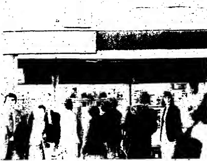
Police watch over arriving passengers at Zaventem Airport outside Brussels after anonymous calls warned of a Palestinian terrorist attack if the Belgian government did not release two Palestinians arrested last month for a grenade attack at the airport.